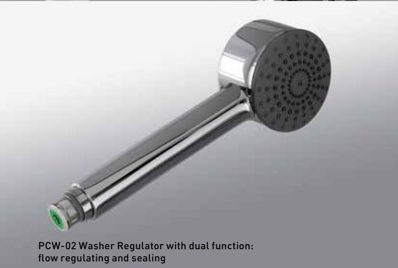
PCW-02 Washer Regulator with dual function: flow regulating and sealing