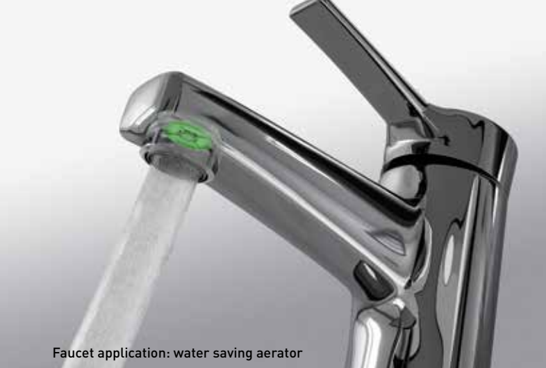
Faucet application: water saving aerator

NEOPERL water savers limit the flow of water in dishwashers, faucets, showers – nearly irrespective of the water pressure: the right amount of water is delivered, neither too little nor too much. A large portion of this saving is hot water. By using less hot water, energy is saved and CO 2 emissions are reduced. Comfort of use is assured because the water coming out of a water saving faucet is mixed with more air resulting in a full stream, light and pleasant.